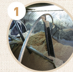
Inspection & Mixing